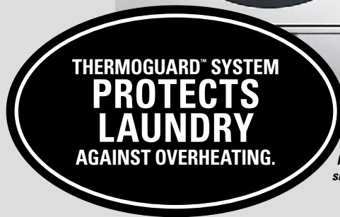
Model MLG32PDB shown in Stainless Steel.