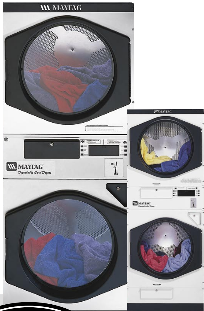
Model MLG32PDB shown in White.